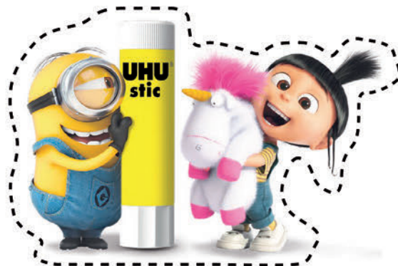
MEL & AGNES