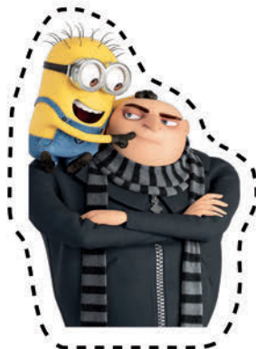
DAVE & GRU